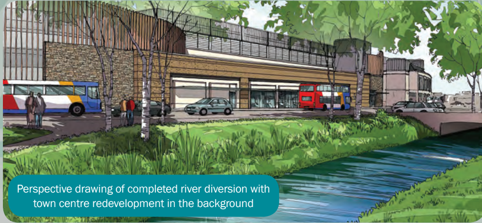
Perspective drawing of completed river diversion with town centre redevelopment in the background

The first phase of the project involves diverting the River Bure (more commonly known as the Town Brook) to provide land for the town centre redevelopment and diverting underground utility services. These works started in August with earth works to create the new river channel on the western side of Manorsfield Road.